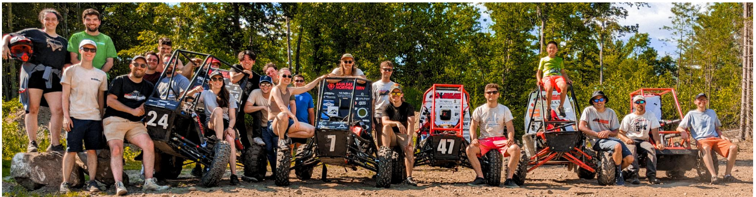
Summer '22 Alumni Drive Day - featuring, from left to right, our '22, '19, '17, '09, and '99 team vehicles.

For over two decades, the Northeastern BAJA SAE team has been at the forefront of the competition, with multiple top-ten finishes. As a result, our team has earned national recognition as a competitive force and has allowed us to form relationships with insightful students around the world.